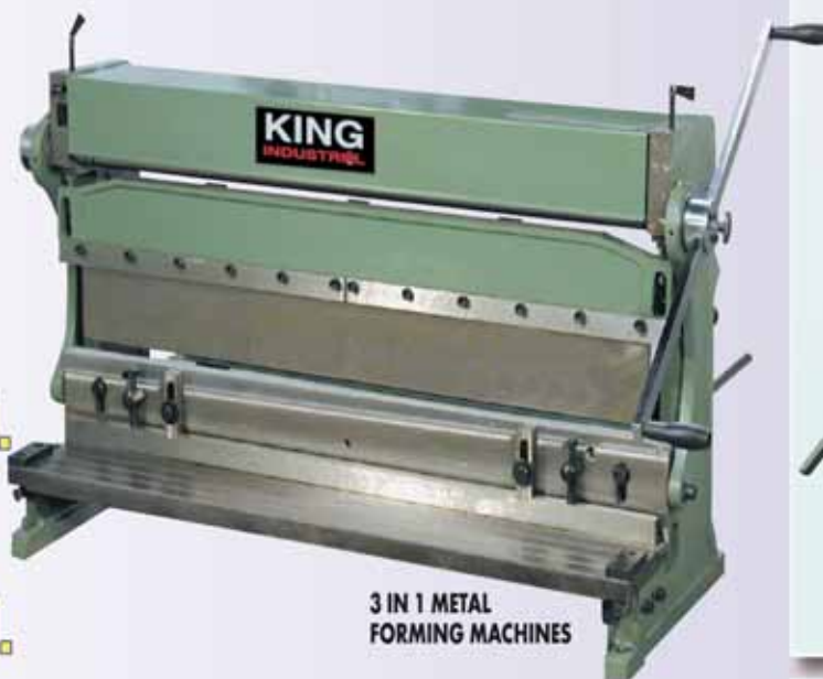
3 IN 1 METAL FORMING MACHINES