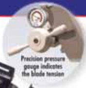
Precision pressure gauge indicates the blade tension

PATENTED TRU-LOCK quick locking vise system